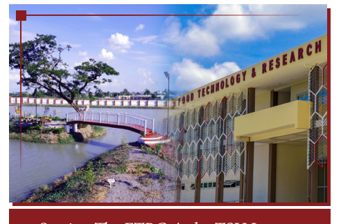
Stories: The FTRC & the TSU Lagoon