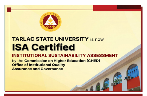
TSU receives ISA certification, reaps recognitions from AACCUP and DOE